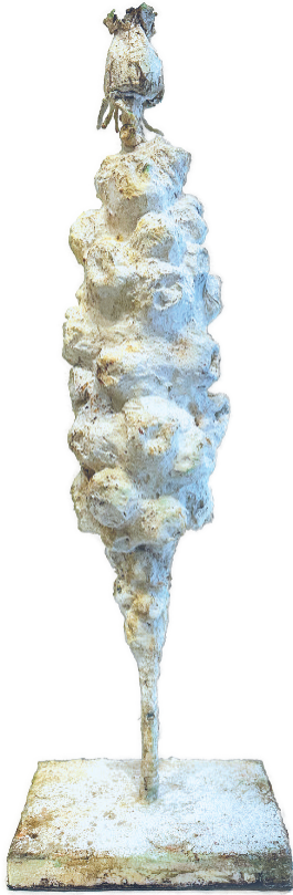
Morpheus , 2023. Copper Tubing, Plaster, Cement, Steel, and Paper. (23 in. x 7 in. x 5 in.)