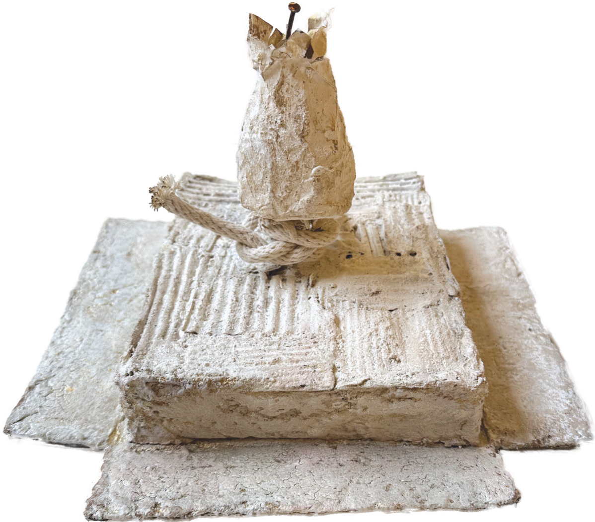
Untitled, 2023. Mixed Media. (8 in. x 12 in. x 12 in.)