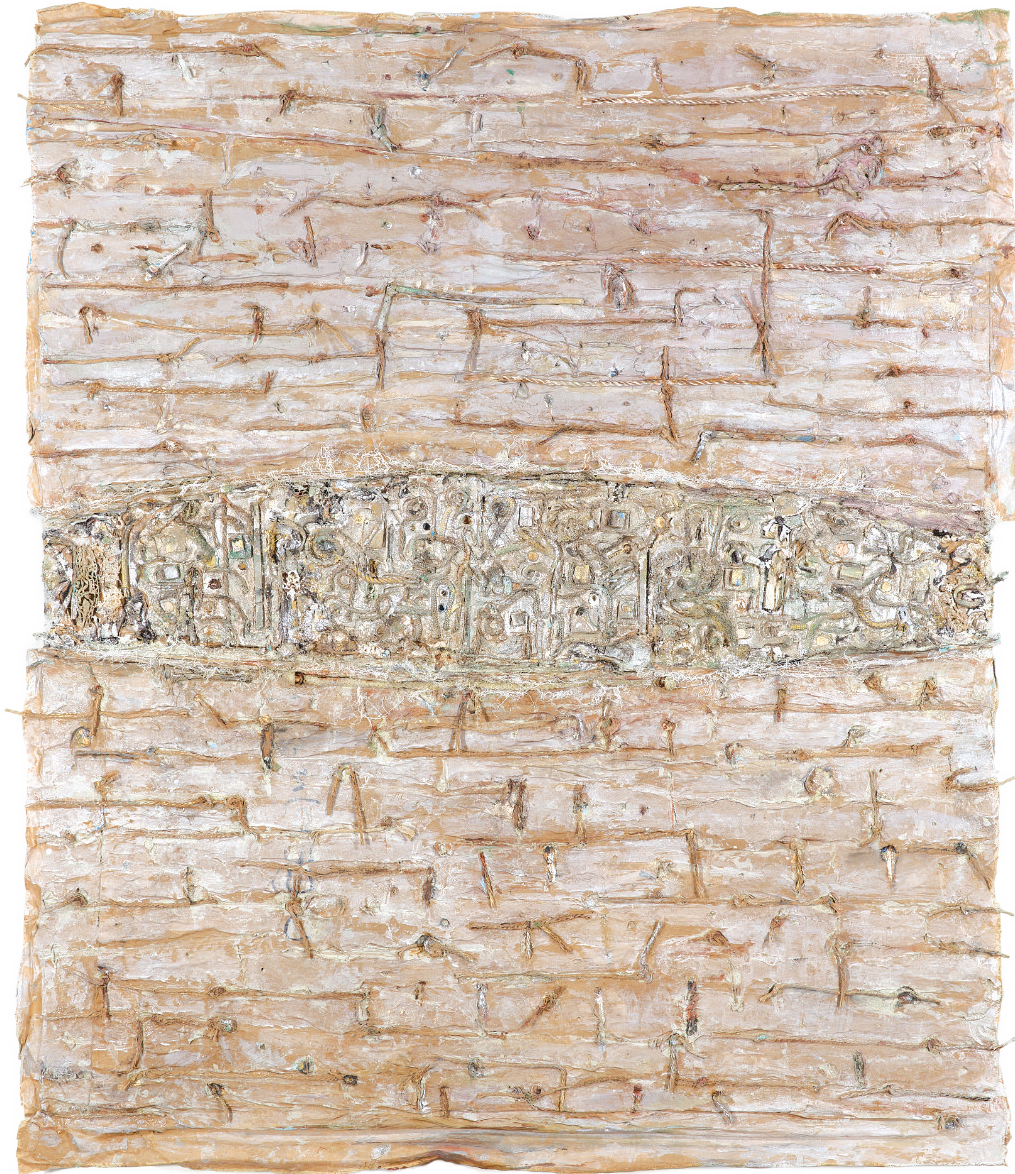
Ancient City (White) , 2023. Zaun Series . Acrylic, Cement, Latex, Thread, Found Objects, and Paper on Cardboard (41 in. x 35 1/2 in.)