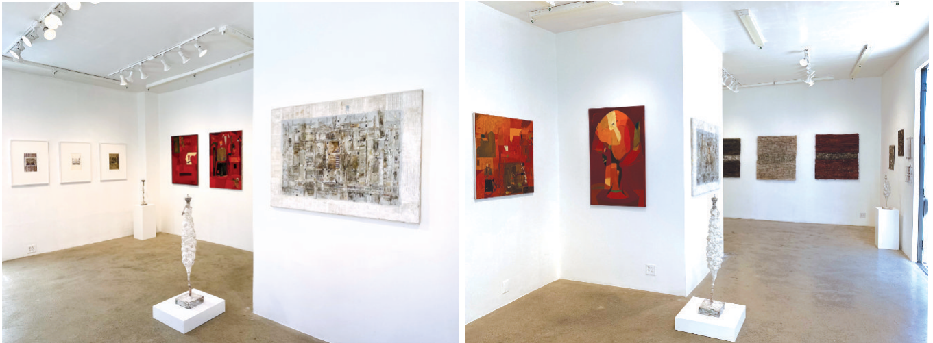
Install images at Reisig and Taylor Contemporary

Ovsepyan’s works are included in public and private collections in Russia, Europe, Israel, Canada, and the United States, including: UNESCO, Geneva, Switzerland; Pushkin Museum, Moscow; Museum of Modern Art, Armenia, Yerevan; Museum of Modern Art, Georgia, Tblisi; Sparkasse Schleswig-Holstein, Germany; Sparkasse, Muenster, Germany; Provincial Versicherung; Bundesministerium der Verteidigung, Kiel, Germany.