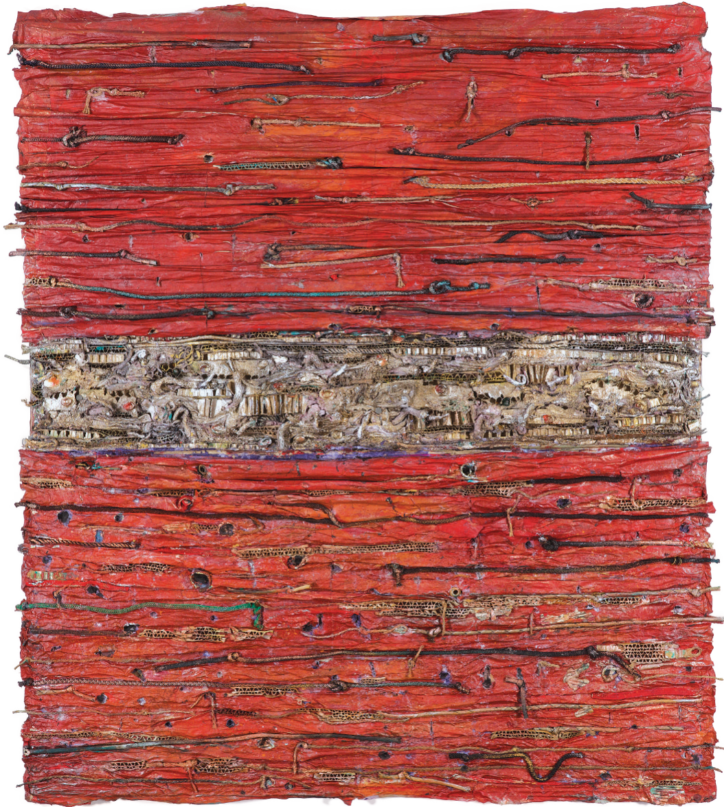
Ancient City (Red) , 2023. Zaun Series Acrylic, Cement, Latex, Thread, Found Objects, and Paper on Cardboard (41 in. x 35 1/2 in.)