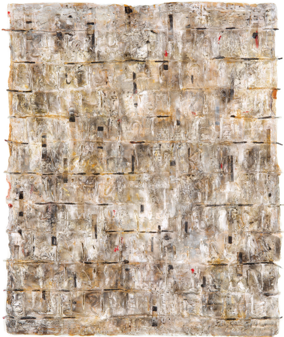
Untitled, 2005-2006. Magaxat Series . Mixed Media (Tempera, Wax, Pastel, Thread) on Cardboard. (17 1/2 in. x 14 in.)