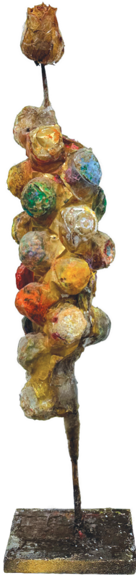
Untitled, 2023. Mixed Media. (19 in. x 4 in. x 3 in.)