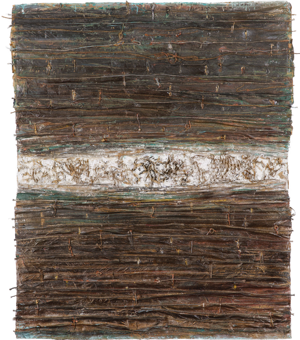
Ancient City (Green) , 2023. Zaun Series . Acrylic, Cement, Latex, Thread and Paper on Cardboard (39 1/2 in. x 33 in.)