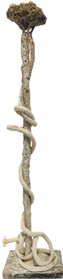
Untitled, 2023. Mixed Media and Wasp Nest. (19 1/2 in. x 5 in. x 3 in.)