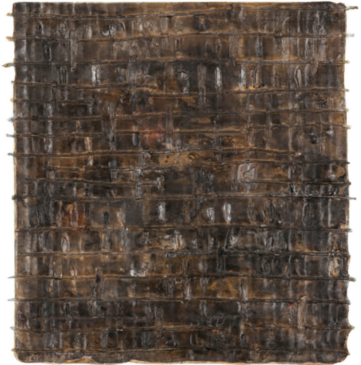
Zaun, 2010. Mixed Media on Cardboard. (11 1/2 in. x 10 1/2 in.)