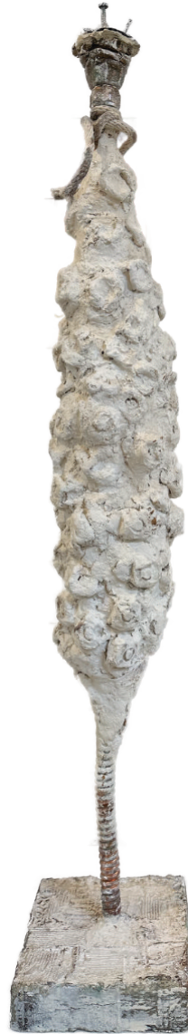
Finding Nirvana , 2023. Copper Tubing, Plaster, Cement, Steel, and Paper. (42.5 in. x 7 1/2 in. x 7 1/2 in.)