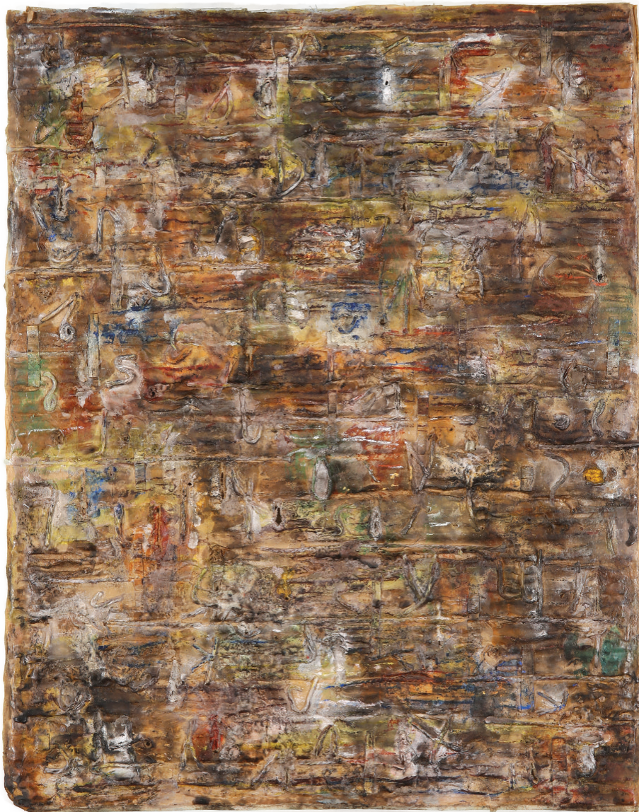
Untitled, 2005-2006. Magaxat Series. Mixed Media (Tempera, Wax, Thread) on Cardboard. (17 in. x 13 1/2 in.)