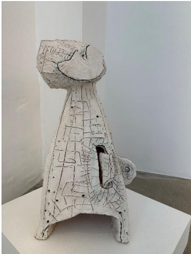
A Piece Of Me