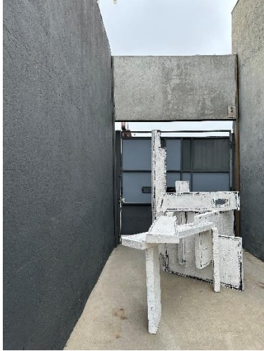
Plays On Perspective