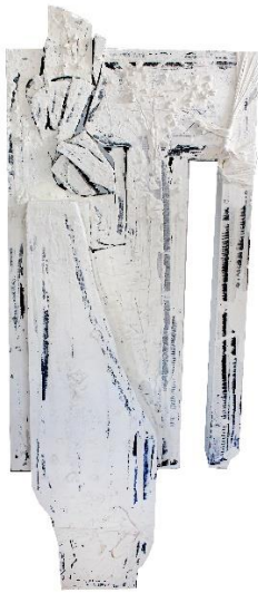
Growing Chamomile In The Backyard