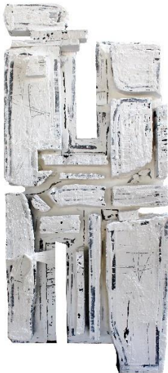
The Smell Of Wet Concrete