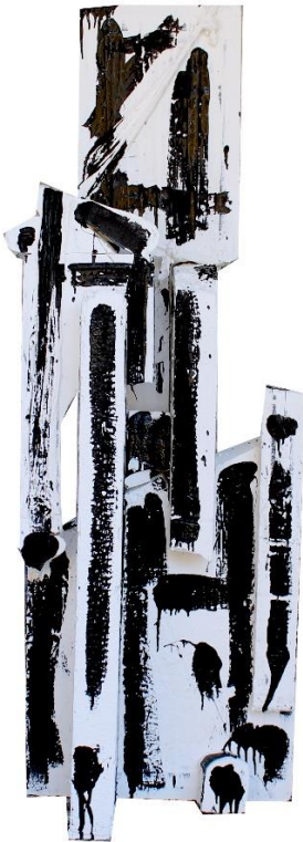
An Unlikely Embrace