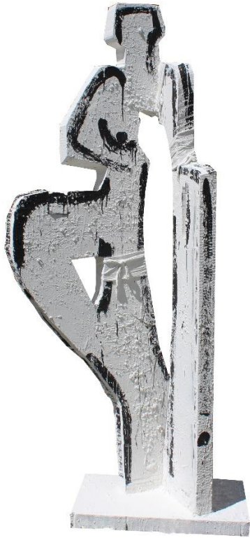
One Giant Creamsicle