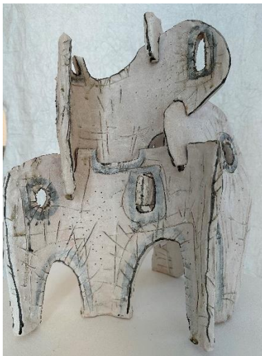
Somewhere In Los Angeles