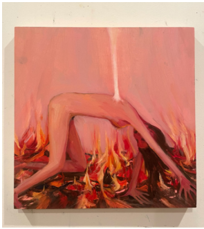
Emma Gray Healing of the Fourth Chakra 12 x 12" Oil on wooden panel