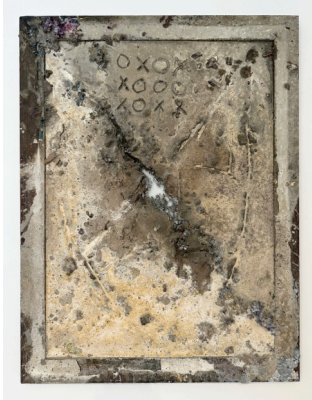
Saun Santipreecha Tic Tac Toe , 2023 Cement, shellac, wood stain, ink, shredded paper, ash, gold leaf on found frame. 32" x 24"