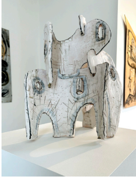
Daniela Soberman Somewhere In Los Angeles , 2021 Ceramic. 23 x 20 x 14 inches.