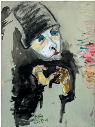
Sinclair Vicisitud Georgia O'keeffe , 2022 Acrylic and Charcoal on Canvas. 24 x 18 x 1 inches.