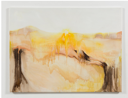
Emma Gray Grounding with the Sun (sun eaters) Oil on canvas 30 x 40"