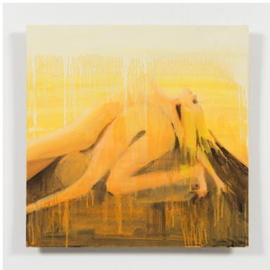
Emma Gray The Sun Eaters 24 x 24" Oil on wooden panel