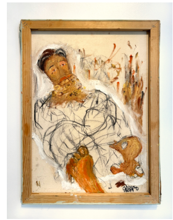
Sinclair Vicisitud Addressing the Terribly Dressed Man 2021 Oil on Canvas. 24 x 18 x 1 inches.