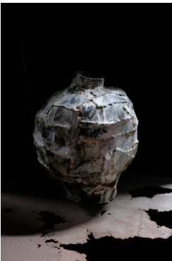
Kento Saisho Drawn Vessel , 2021 Patinated steel, paint, graphite, mixed media 12"x13"x18"