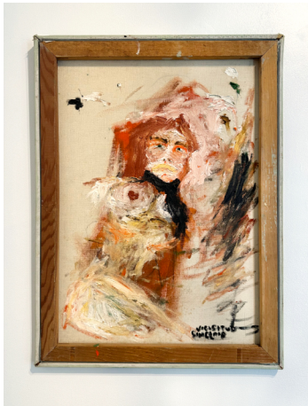
Sinclair Vicisitud Jeane Nude , 2022 Oil on Canvas. 24 x 18 x 1 inches.