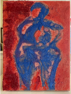
Erica Everage Not a Venus (in lapis lazul) , 2023 Mixed media on burlap 12" x 9"