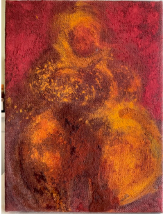
Erica Everage Megalithic Merigold , 2023 Mixed media on burlap 12" x 9"