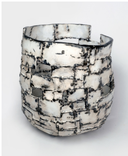
Kento Saisho White Vessel , 2021 Patinated steel, paint 12"x11"x13"