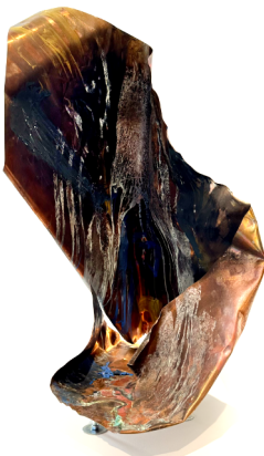
Saun Santipreecha Let the Wind Speak , 2023 Copper plate, acrylic, vinegar, salt, bolts, aural exciters, wood, speaker amplifier, with computer running Max application of sound installation (including audio files) and separate monitor for schematics display. 73.5 x 18 x 30.5 inches