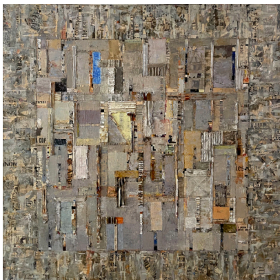
Rudik Ovsepyan Borderline , 2009 Mixed Media on Linen 36 x 36 x 1 in