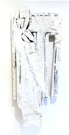
Daniela Soberman Growing Chamomile In The Backyard , 2023 Paint, Plaster, Fabric on Polystyrene. 55 x 22 x 8 inches.