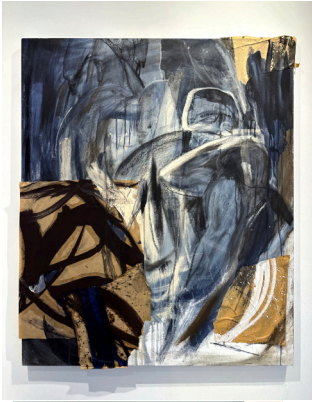
Keywan Tafteh Group Effort , 2022 Acrylic paint, Spray paint, Charcoal, Collage, Palm on Canvas. 48 x 40 inches.