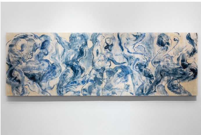
Erica Everage Dance Frieze (Channeling the Hag) 2023 Acrylic, wax and oil on wood panels 48 x 144"