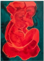
Erica Everage Rebel Caryatid IV , 2023 Acrylic, oil, oil stick, and wax on canvas 48 x 36 inches