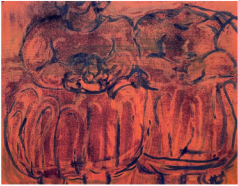
Erica Everage Maltese Twin Megaliths , 2023 Acrylic and raw pigment on wood panel 11 x 14 inches