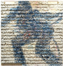
Erica Everage Future Shadow , 2023 Acrylic, marker, oil stick, raw pigment and wax on recycled foam composite on reclaimed wood panel 37 x 37 inches