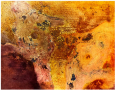
Erica Everage Mirror Games , 2023 Acrylic, raw pigment, dye on wood panel 11 x 14 inches