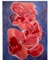
Erica Everage Rebel Caryatid I , 2023 Acrylic, oil, oil stick, and wax on canvas 48 x 36 inches